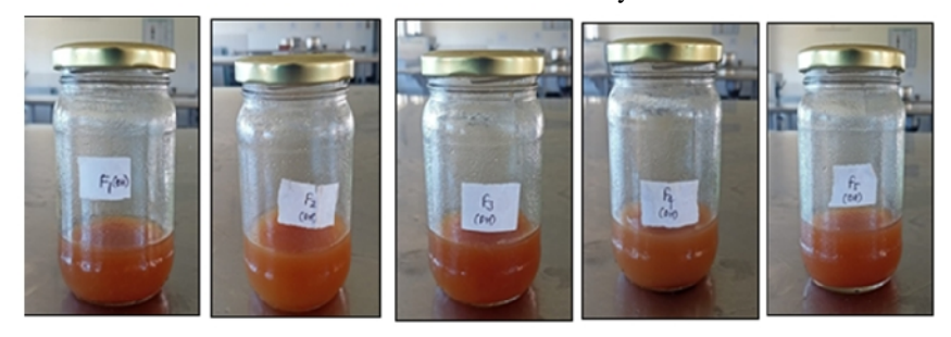
Fig. 4. Formulations of Hot air oven dried fruit powders drink mix.

After formulation with all fruit powders from solar dried powders and hot air oven, further it was carried for sensory evaluation.