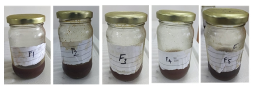
Fig. 3. Formulations of solar dried fruit powders drink mix.

Formulation- 5: The ratios for formulation two are Apple (50%), Grapes (2.5%), Mango (7.5%), Orange (2.5%), Sapota (7.5%), and Sugar (30%).