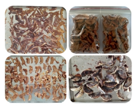
Dried fruits of solar dryer Dried fruits of Hot air oven Fig. 1. Different dried fruits of solar dryer and Hot air oven methods.